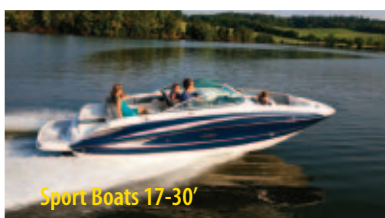
Sport Boats 17-30'