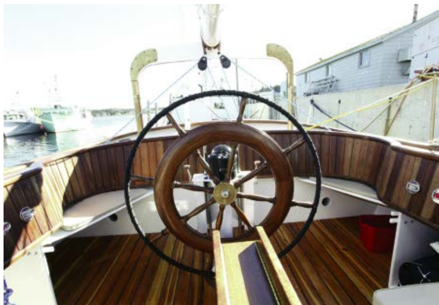
The cockpit and custom made wheel are built of Angelique.