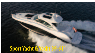
Sport Yacht & Yacht 39-61'