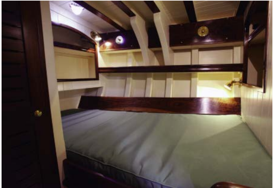
The double berth in the master cabin.

Quebec Marina Gagnon et files Itée 50 62nd Avenue St. Paul de l'île aux Noix J0J 1G0 Tel: (450) 291-3336 www.marinagagnon.com