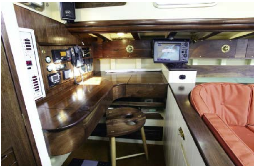
The "Ship's Office" is built of Black Walnut.