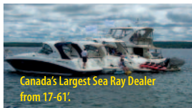
Canada's Largest Sea Ray Dealer from 17-61'