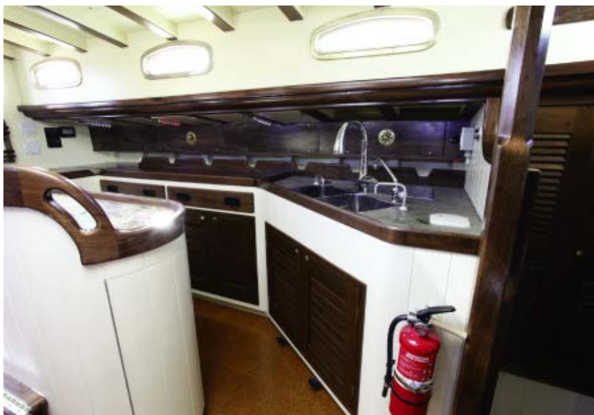
Looking aft into the galley.