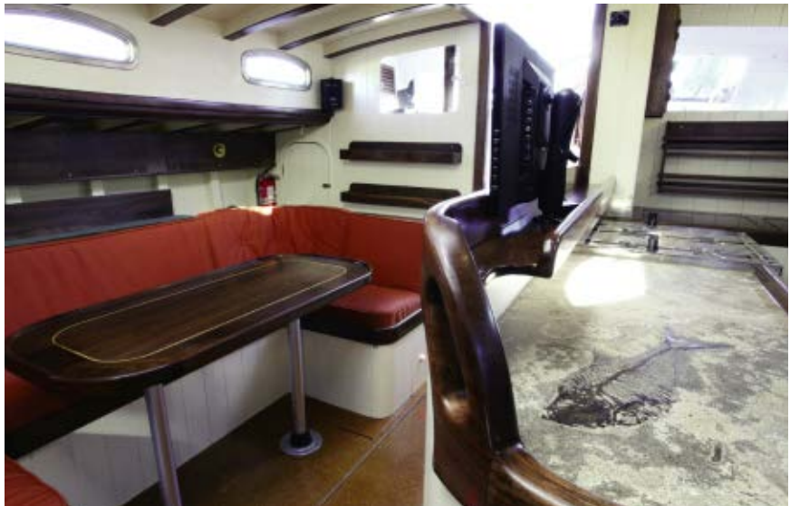
The crew mess to the left and to the right the ancient fish fossil in the galley counter.

house, only one block from ground zero in New York, was being torn down. Steele discovered that it was constructed with very old beams of Douglas fir and pitch pine. These were acquired and trucked to the yard where they were milled to create the 1½-inch planks and laminated 3-inch square beams. The hull was built upside down and covered with E-glass in epoxy to a mirror-like finish, then turned right side up (a major feat in itself) for