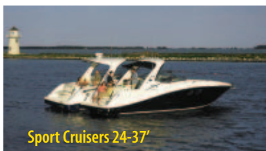
Sport Cruisers 24-37'