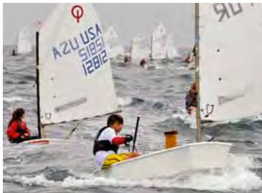
ABOVE The Optimist dinghy is one of the few boats you'll see using a spritsail nowadays