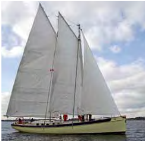
Covey Island Boatworks