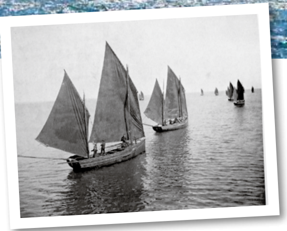
Cornish luggers sailing out of Mevagissey in the days when fishing fleets were all sail

From spritsail, lugsail and square sail rigs to gaff, Bermudan and gunter, Peter K Poland traces the differing configurations of spars and sails up to the present day