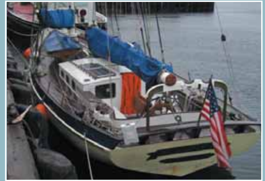
At journey's end in Lunenburg