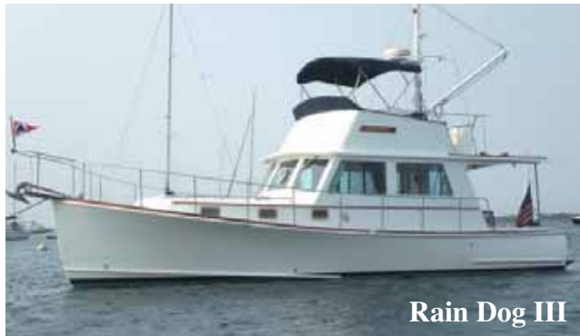
Rain Dog III

Moonbeam was (originally built as “Twombly” by Covey Island Boatworks in 2000.